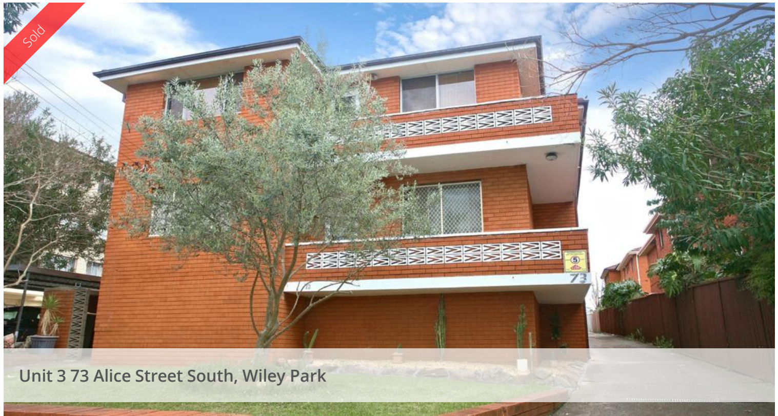
Unit 3 73 Alice Street South, Wiley Park