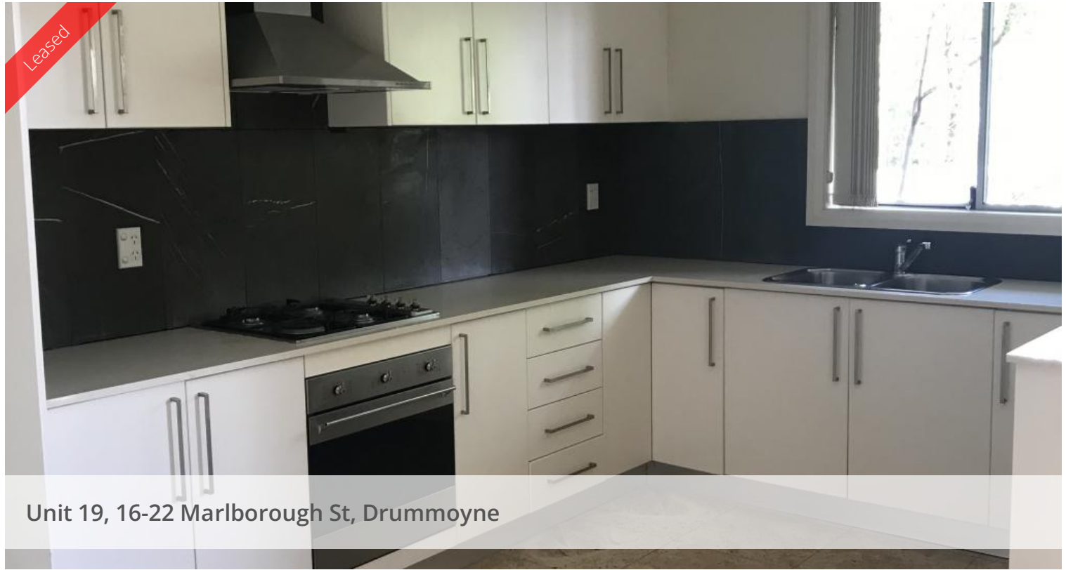
Unit 19, 16-22 Marlborough St, Drummoyne