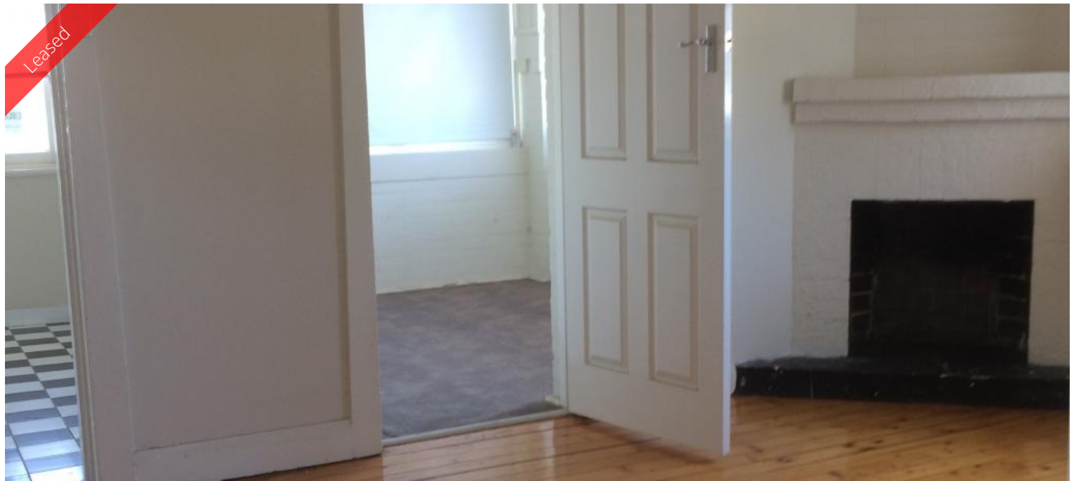
Unit 2, 1 Stone St, Earlwood